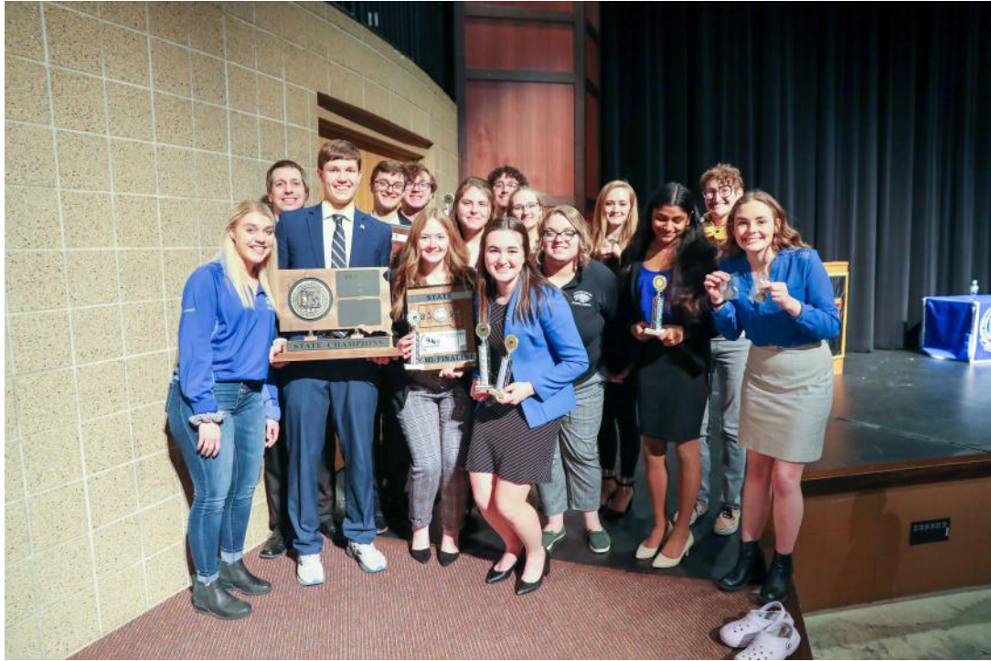
State Class “AA” Sweepstakes Team Champions Aberdeen Central High School