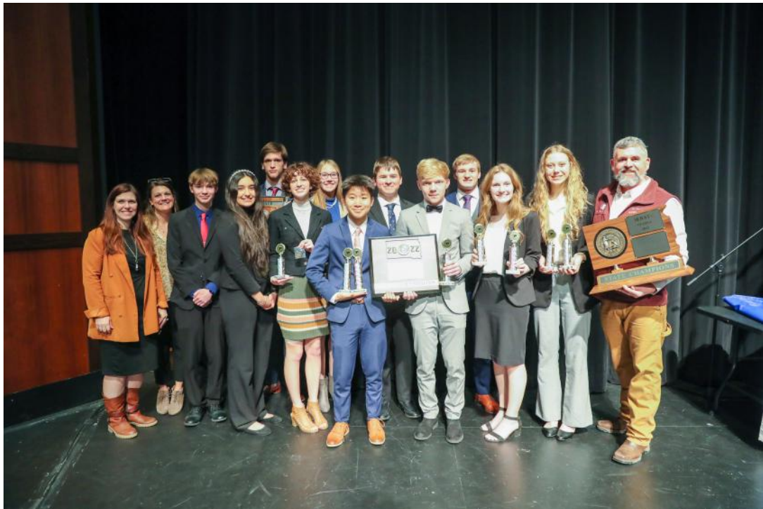
State Class “A” Sweepstakes Team Champions Spearfish High School