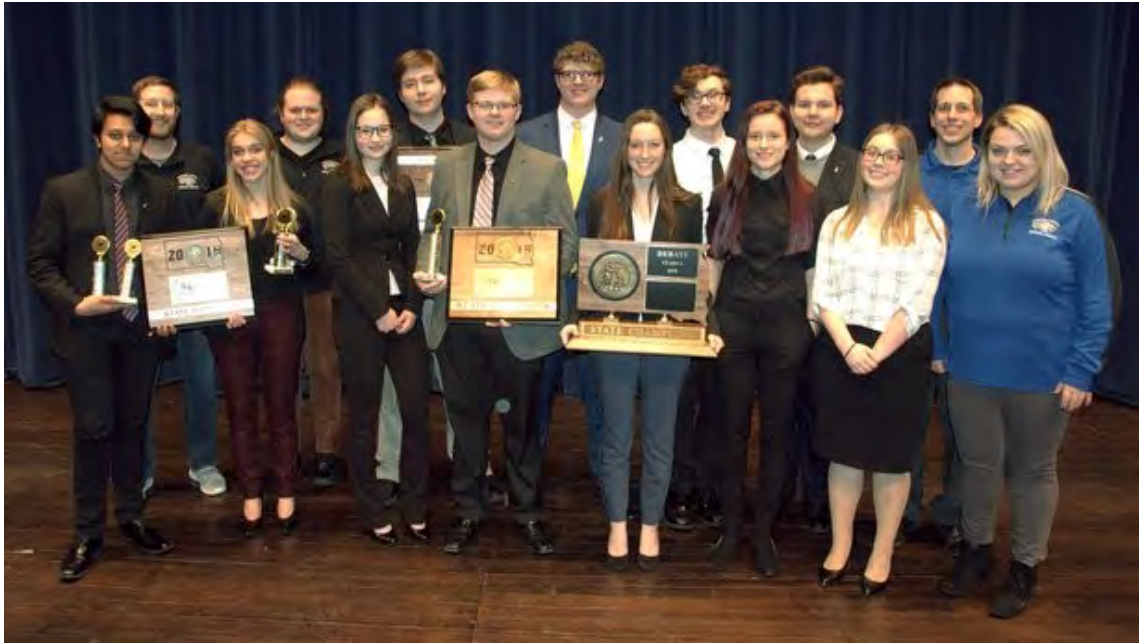
State Class “AA” Sweepstakes Team Champions Aberdeen High School