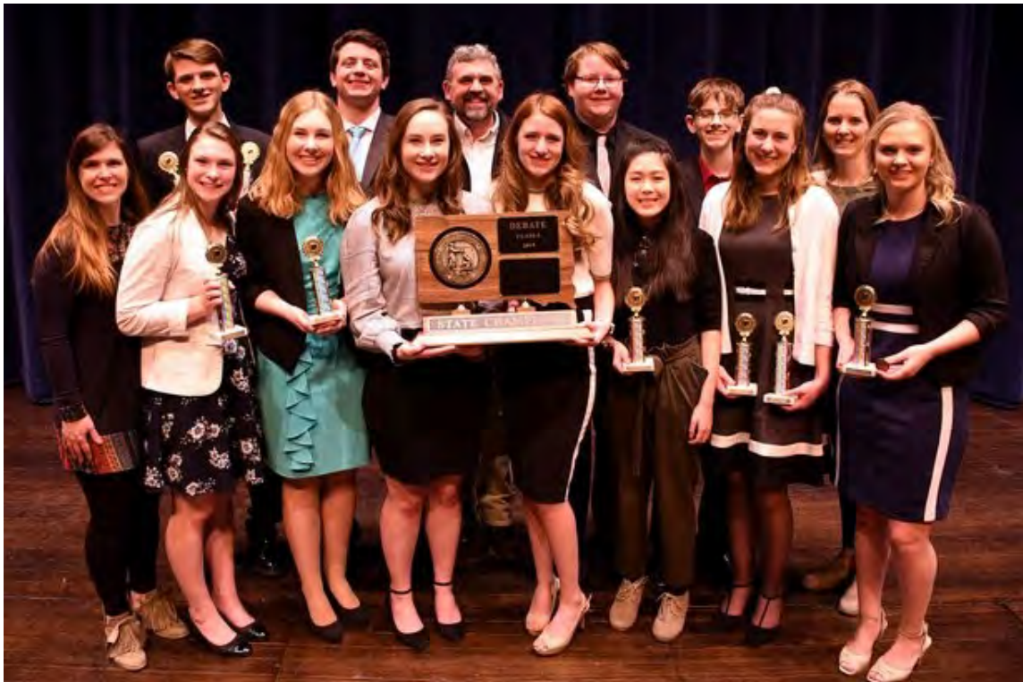
State Class “A” Sweepstakes Team Champions Spearfish High School