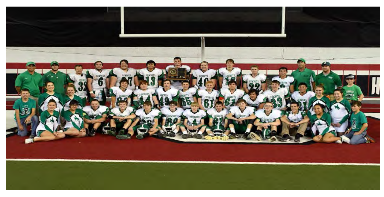
Class 9B Champions Colome Cowboys