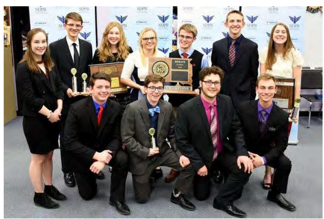
State Class "A" Sweepstakes Team Champions Spearfish High School