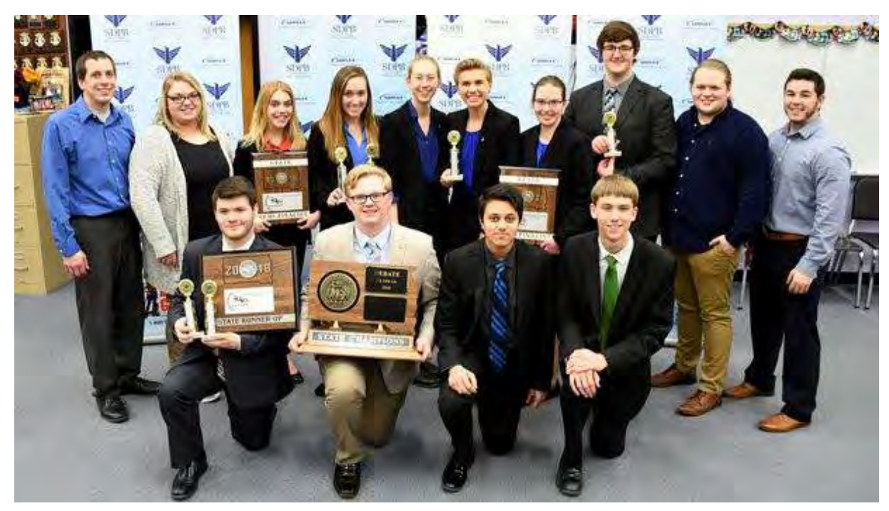
State Class "AA" Sweepstakes Team Champions Aberdeen High School