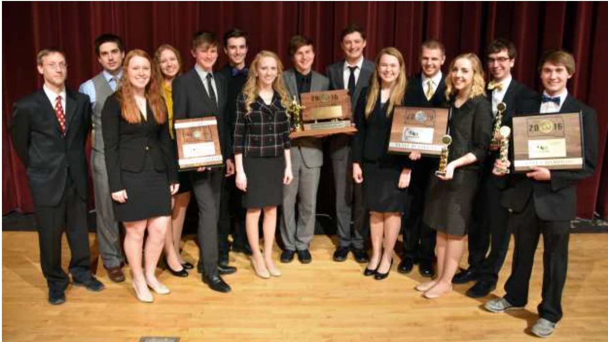
State Class “AA” Sweepstakes Team Champions Watertown High School