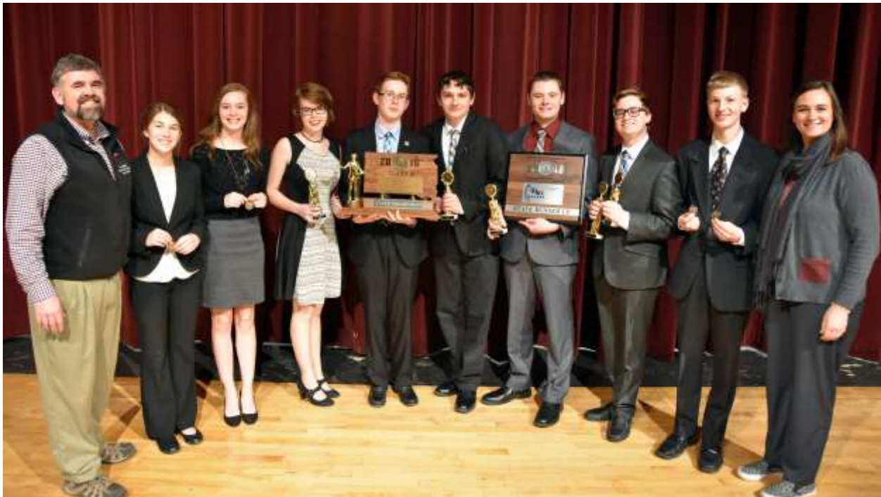
State Class “A” Sweepstakes Team Champions Spearfish High School