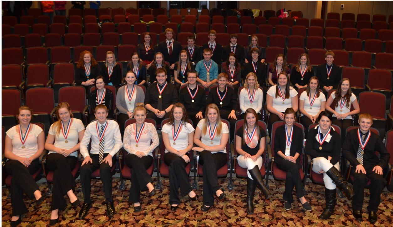
Class "B" Readers Theatre Superiors