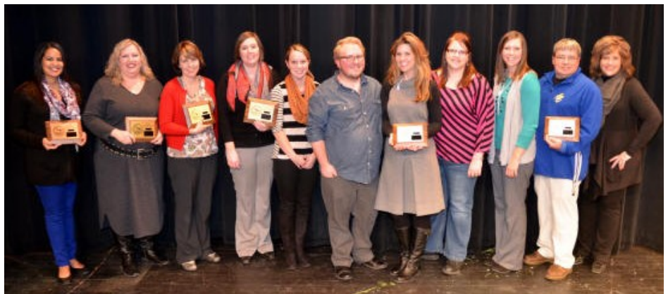
2013 Class AA Team Excellence Awards