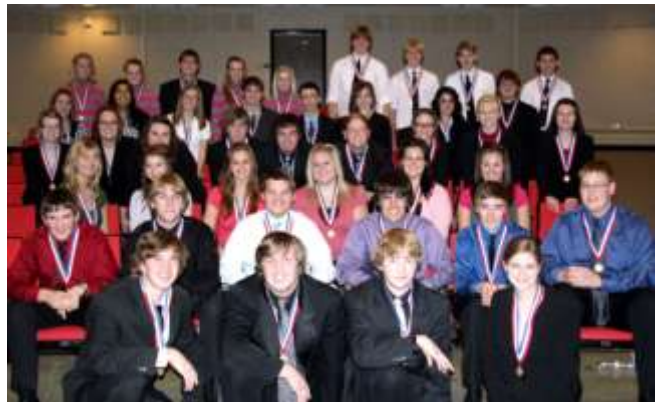
Class "A" Readers Theatre Superior Groups