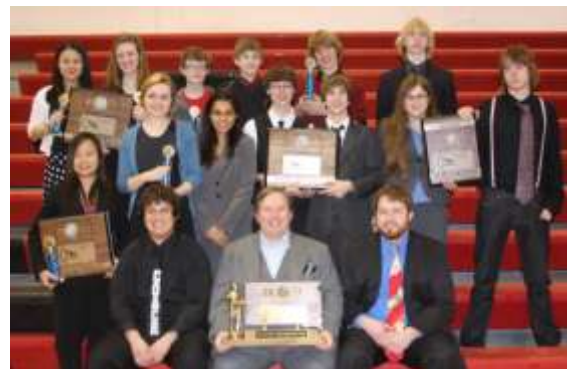
State Class "A" Sweepstakes Team Champions: Vermillion High School