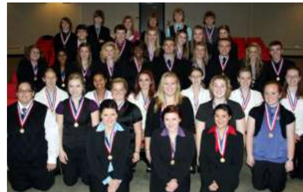
Class "AA" Readers Theatre Superior Groups