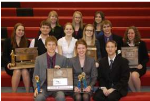
State Class "AA" Sweepstakes Team Champions: Watertown High School