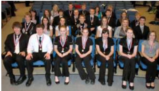
Class "B" Readers Theatre Superior Groups