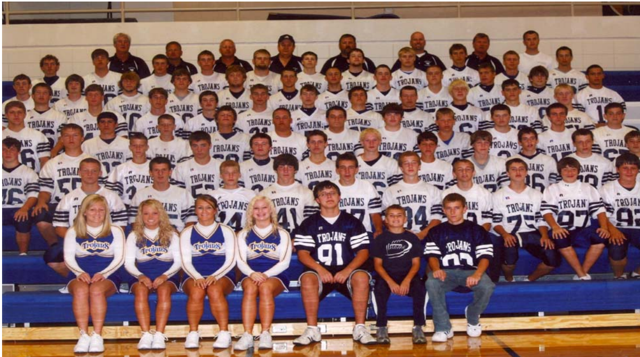
State Class "A" 11-man Champions West Central "Trojans"