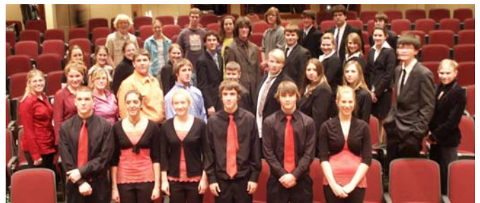
Class "A" Readers Theatre Superior Groups