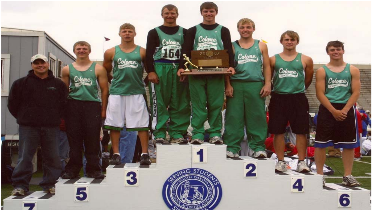
State Class "B" Track and Field Champions Colome Cowboys