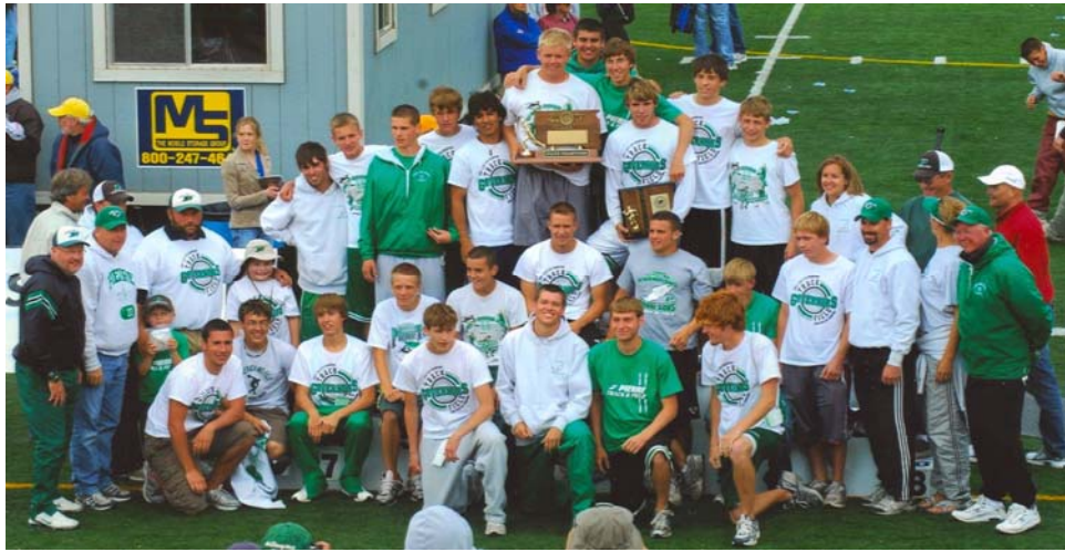
State Class "AA" Track and Field Champions: Pierre Governors