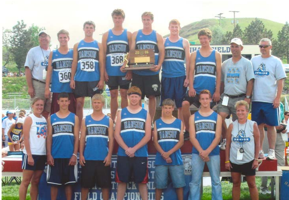
State Class "B" Track and Field Champions: Hanson Beavers