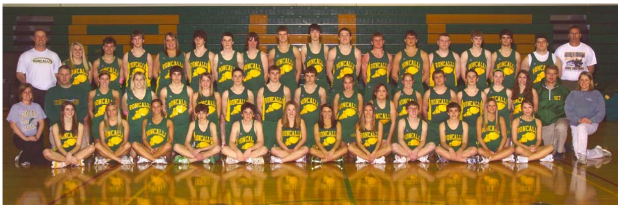
State Class "A" Track and Field Champions: Aberdeen Roncalli Cavaliers