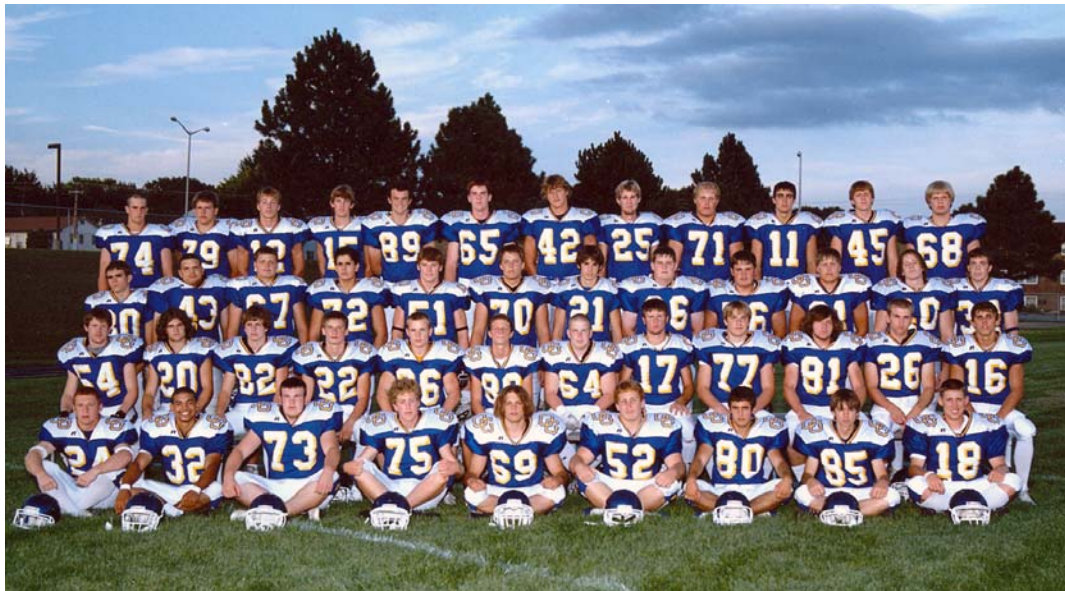
State Class "AA" 11-man Champions: Sioux Falls O’Gorman Knights