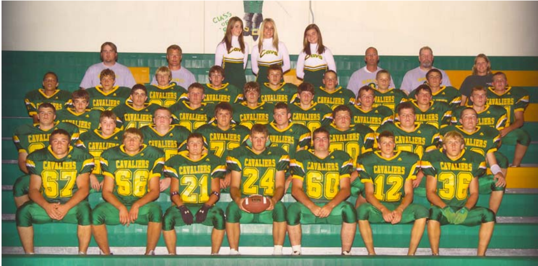
State Class "B" 11-man Champions: Aberdeen Roncalli Cavaliers