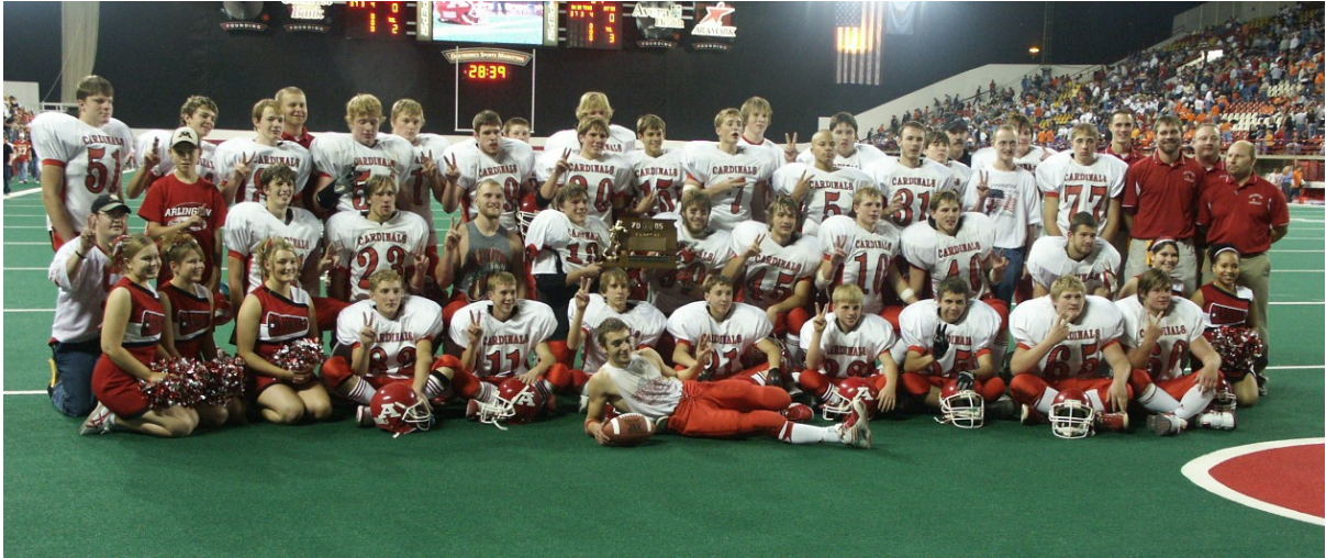
State Class "AA" 9-man Champions: Arlington Cardinals