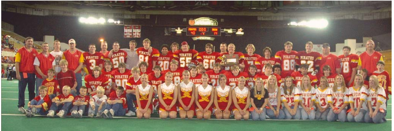
State Class "B" 9-man Champions: Avon Pirates