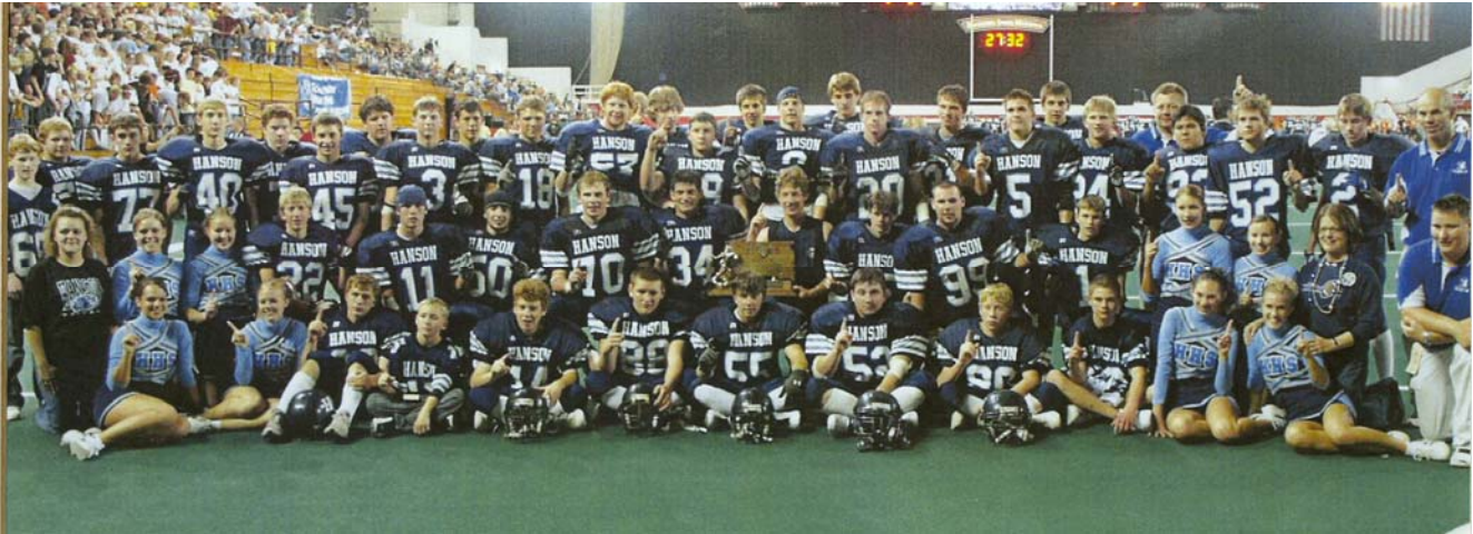
State Class "A" 9-man Champions: Hanson Beavers