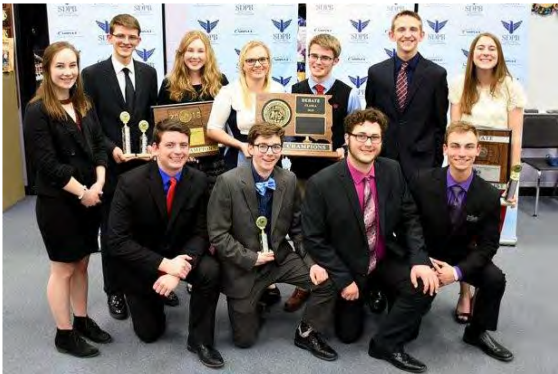
State Class “A” Sweepstakes Team Champions Spearfish High School