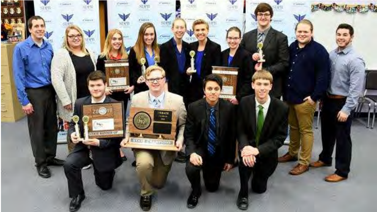
State Class “AA” Sweepstakes Team Champions Aberdeen High School