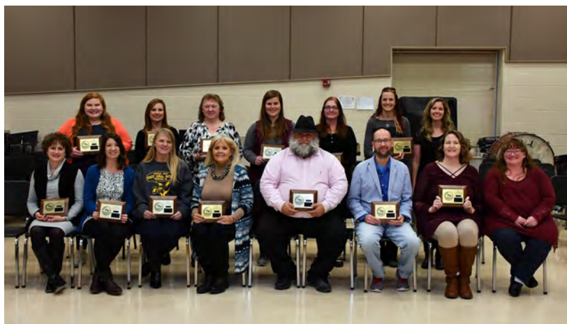
2018 Class A Team Excellence Awards

Sioux Valley St. Thomas More Tea Area West Central