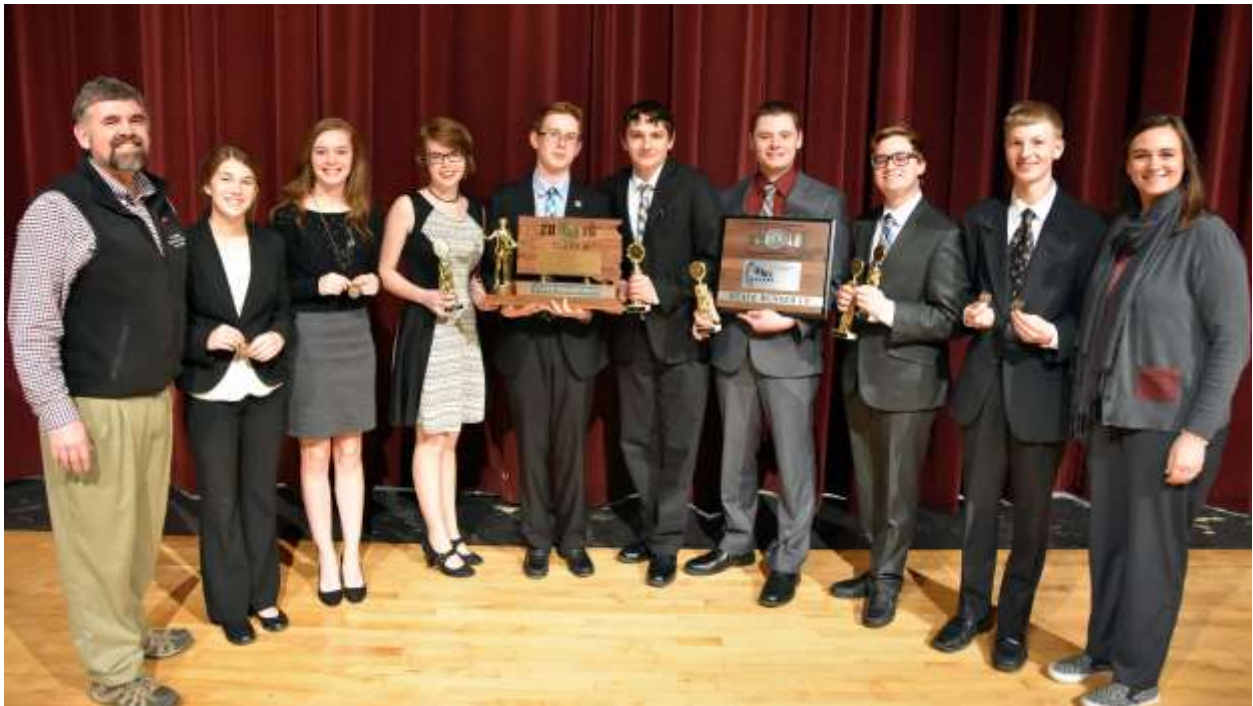
State Class “A” Sweepstakes Team Champions Spearfish High School