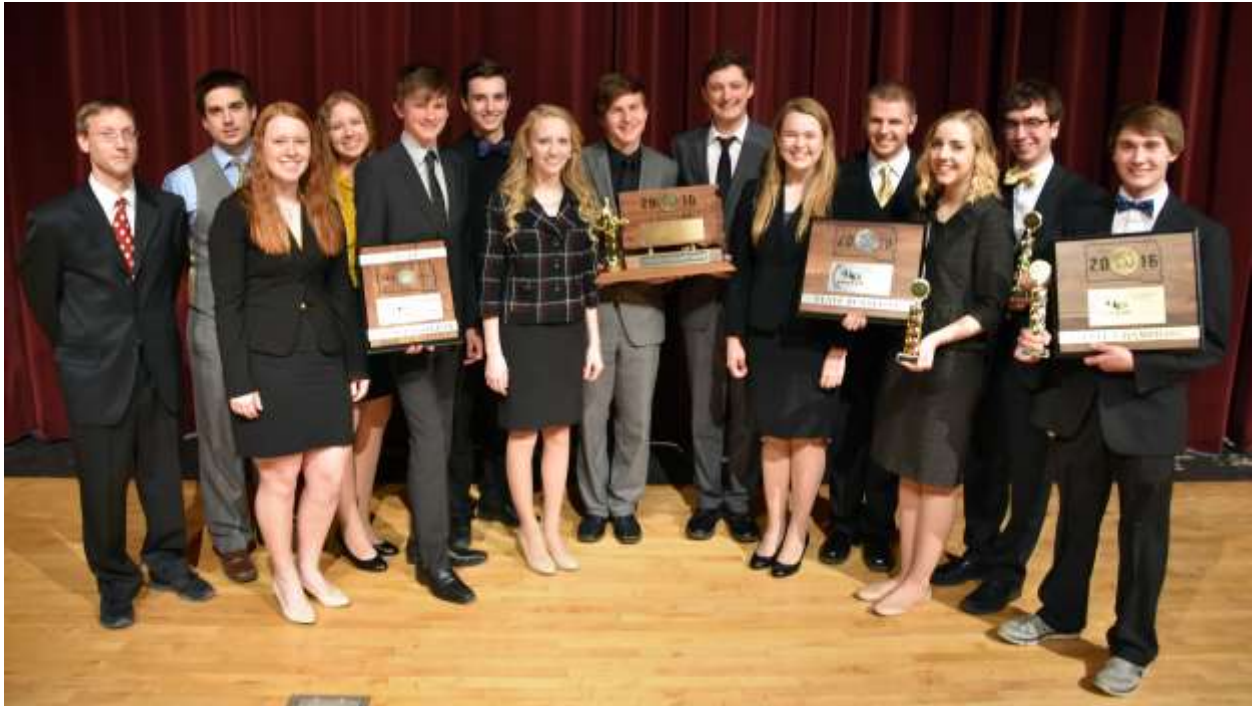
State Class “AA” Sweepstakes Team Champions Watertown High School