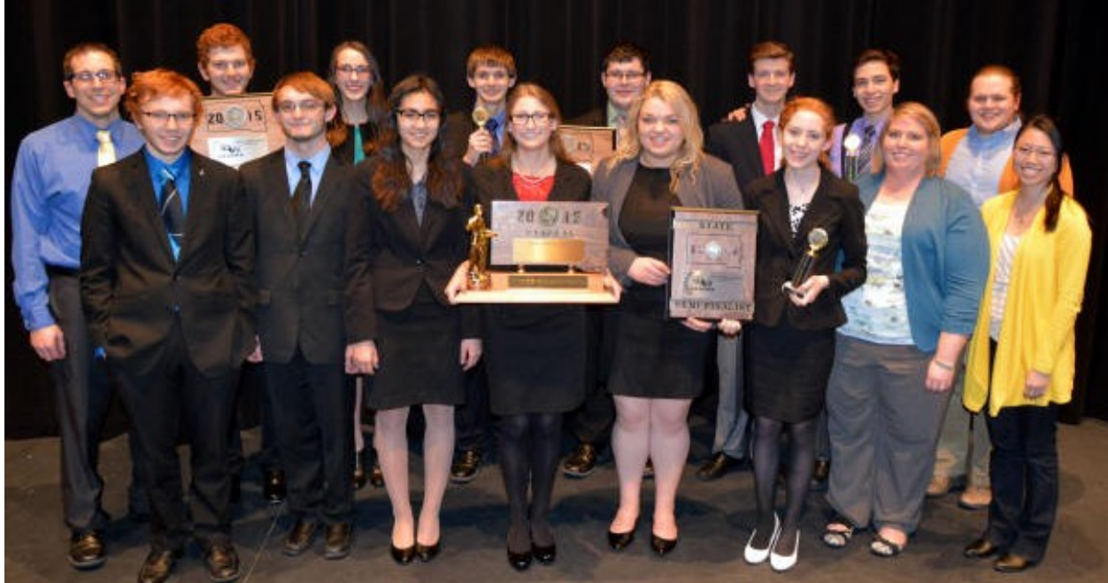
State Class “AA” Sweepstakes Team Champions Aberdeen Central High School