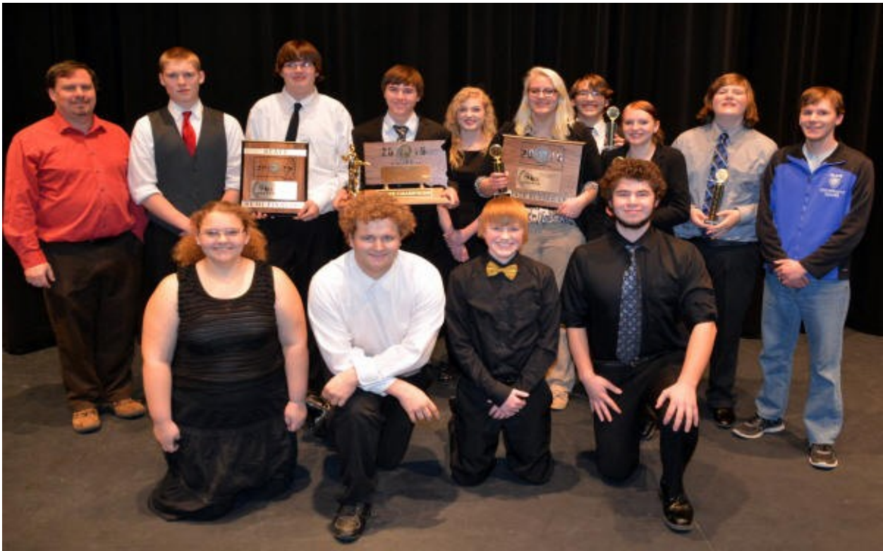
State Class “A” Sweepstakes Team Champions Lennox High School