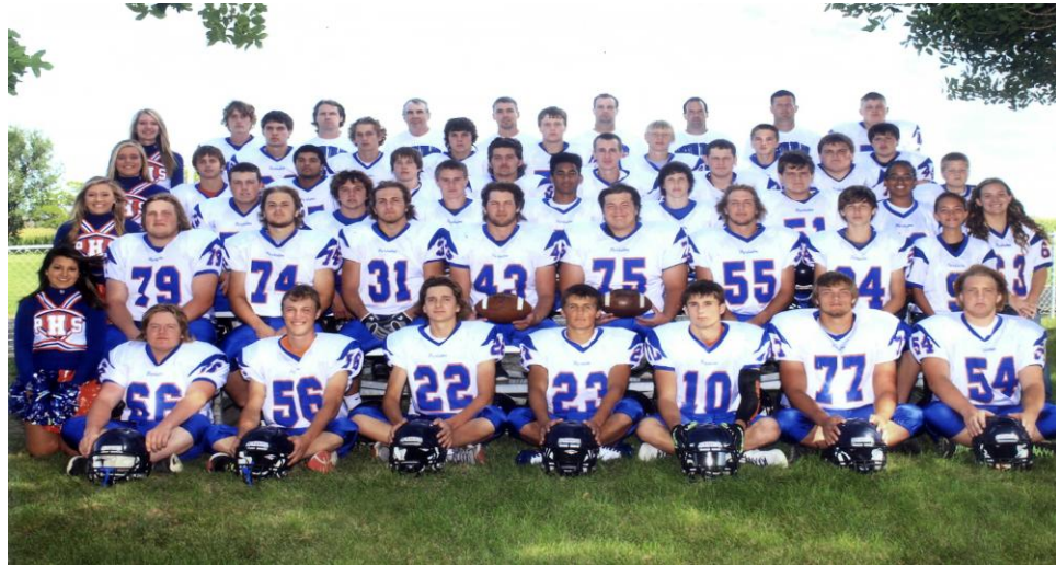
State Class "B" 11-Man Champions Parkston Trojans