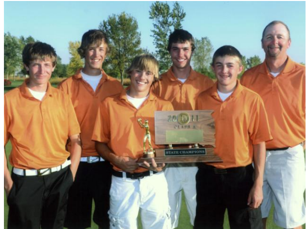
State "A" Champions Dell Rapids