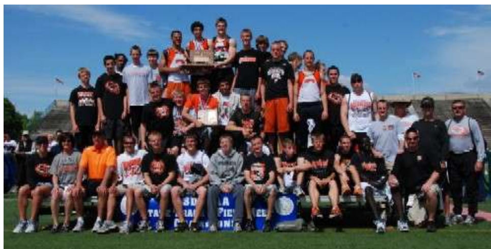
State Class "AA" Track and Field Champions: Sioux Falls Washington Warriors