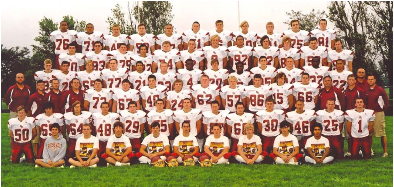
State Class "AA" 11-man Champions: Sioux Falls Roosevelt "Roughriders"