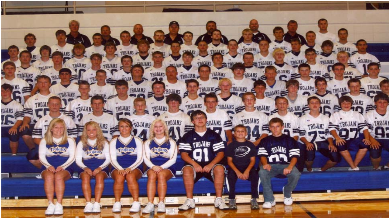
State Class "A" 11-man Champions West Central "Trojans"