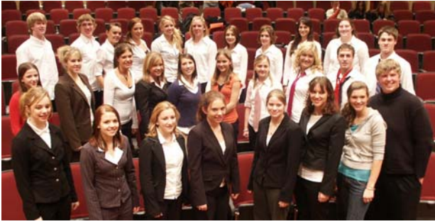
Class "B" Readers Theatre Superior Groups