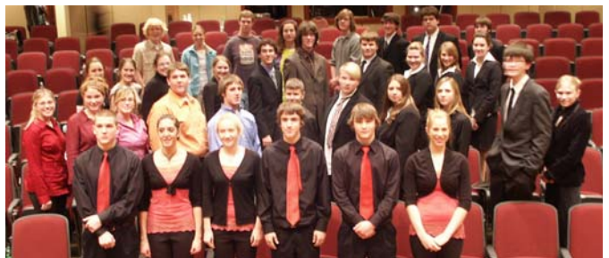
Class "A" Readers Theatre Superior Groups