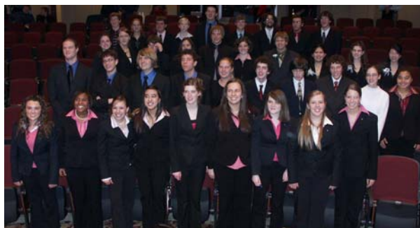
Class "AA" Readers Theatre Superior Groups