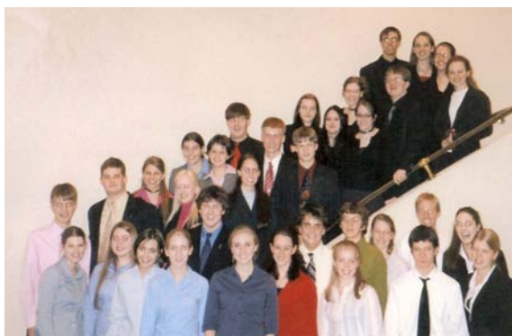
Class "AA" Readers Theatre Superior Groups.