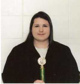
Class "AA" State Original Oratory Champion: