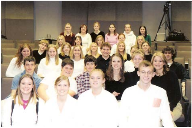
Class "B" Readers Theatre Superior Groups.