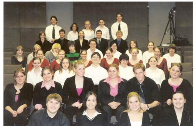
Class "A" Readers Theatre Superior Groups