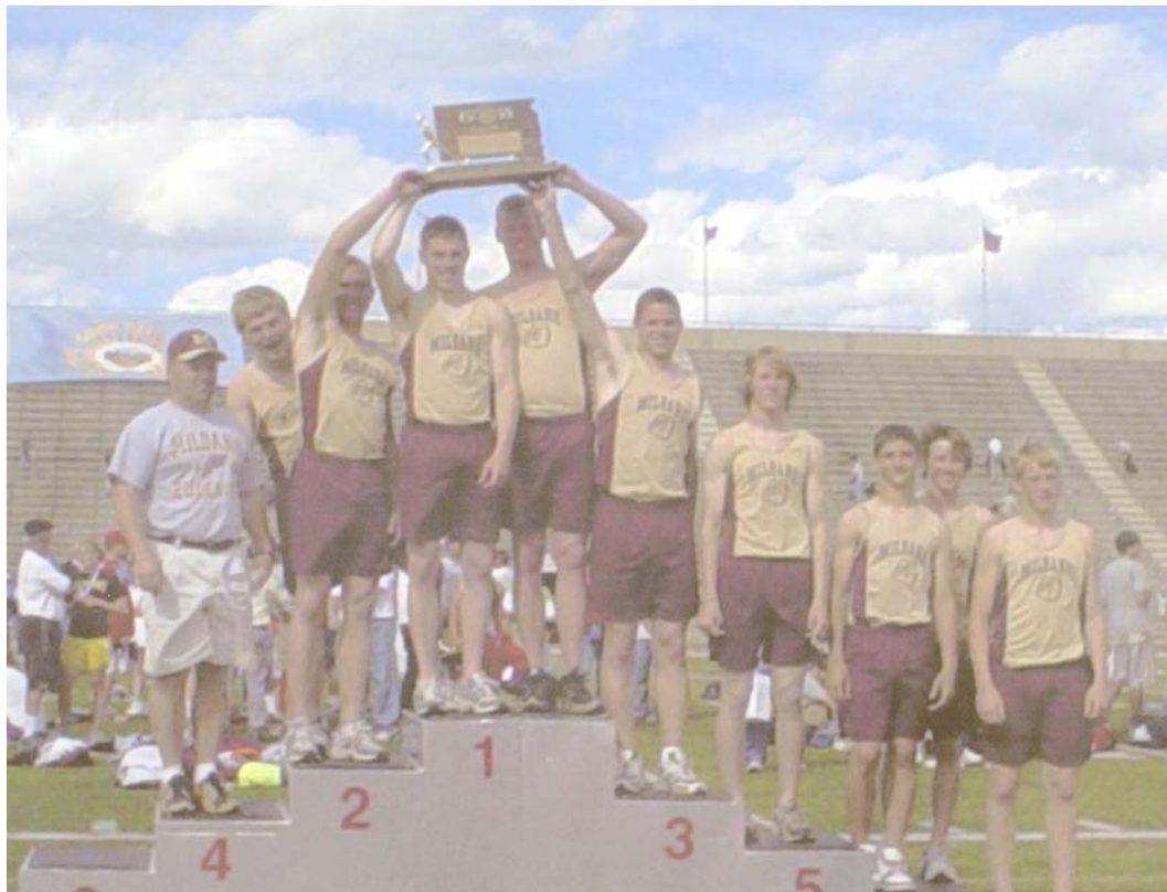
State Class "A" Track and Field Champions: Milbank Bulldogs