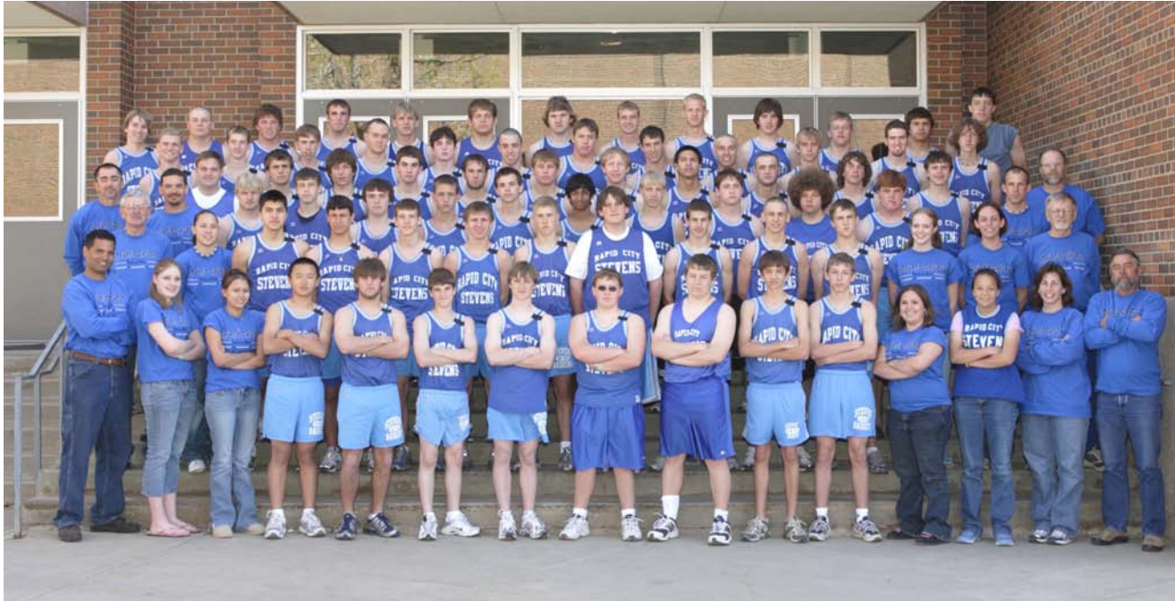
State Class "AA" Track and Field Champions: Rapid City Stevens Raiders